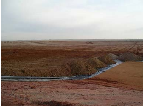
Photo 1 – Stockpiling of classified ore on a specially prepared pad for further leaching

For heap leaching, the milled and classified ore is stockpiled in heaps on specially lined pads.