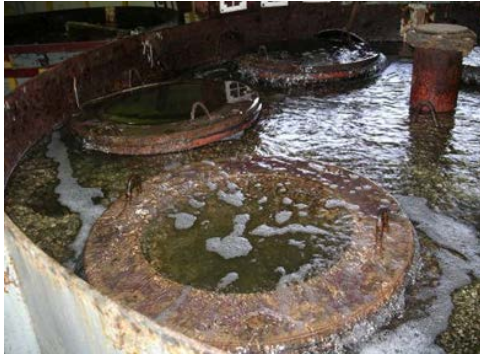
Photo 4 – The gold bearing cyanide solution on the top of an ion exchange column

Design of gold sorption circuits can be based on different techniques: