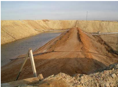
Photo 3 – Collector pond for the pregnant gold solution between the operating heap and dam

The solution percolates through the ore heap and is collected in the pregnant liquor ponds from where it is pumped to the sorption plant. The volume of an operating heap can vary from several hundred thousand to 1.5 million tons of ore. Typically, a heap is leached for one year while a new one is prepared to replace it.