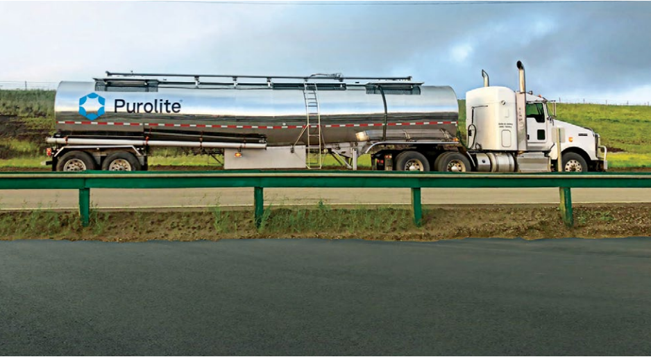
Purolite bulk resin tanker delivers perchlorate selective resin to a site in California